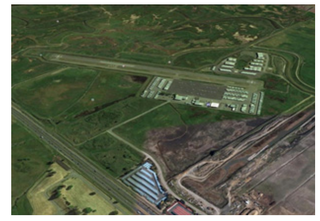
Gnoss Field 1965