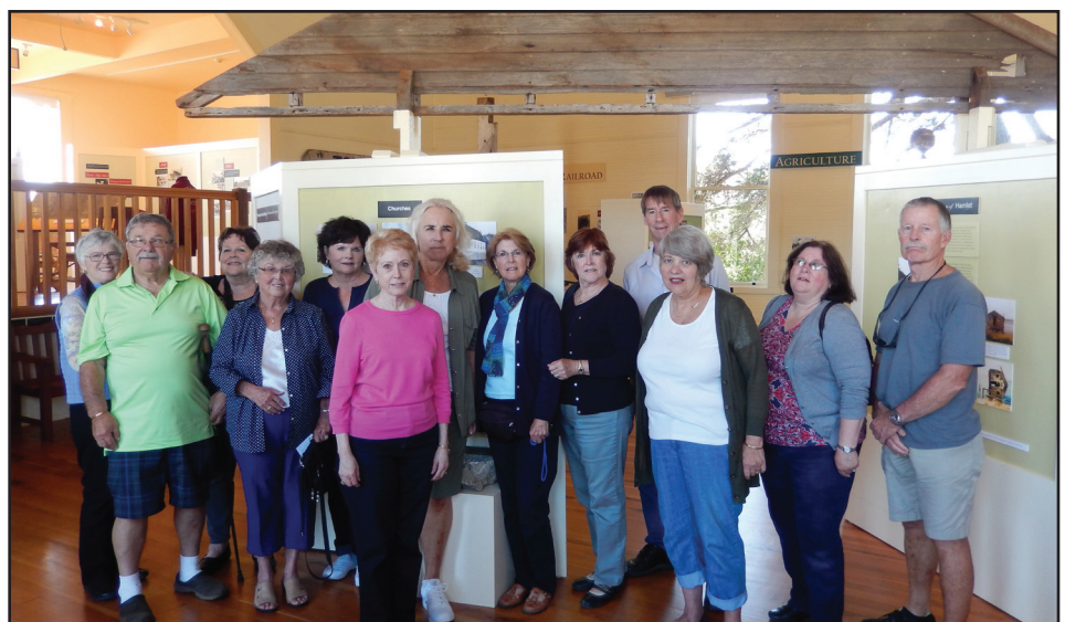
In July the NHG board and friends took a field trip to the Tomales Regional History Center in the west Marin town of Tomales.