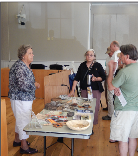
Indian artifacts and books on display from the Museum of the American Indian at the June general membership meeting.