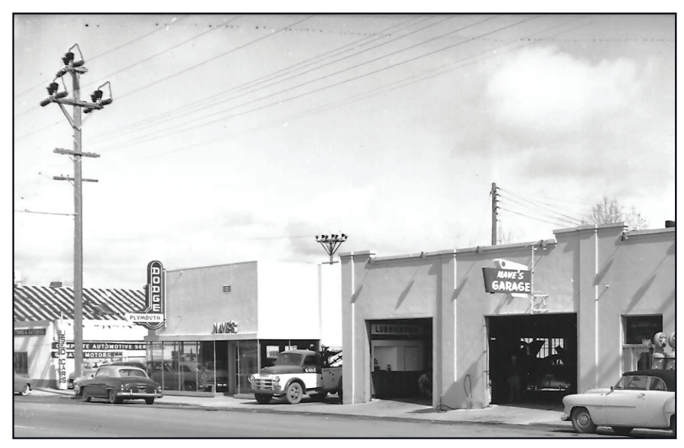
Nave's Garage and Dodge Dealership in 1952

dle had been hollowed out and you could crawl from one end to the other. You could also climb up into the cockpit. The plane was only there a few years and then just disappeared. Behind Brice Brothers grocery store (now Pini Hardware) on south Novato Blvd. there were large trampolines for jumping. They dug large holes in the ground and then stretched the trampoline material over the top. For a nominal fee you could jump for a certain amount of time. These also only lasted a few years.