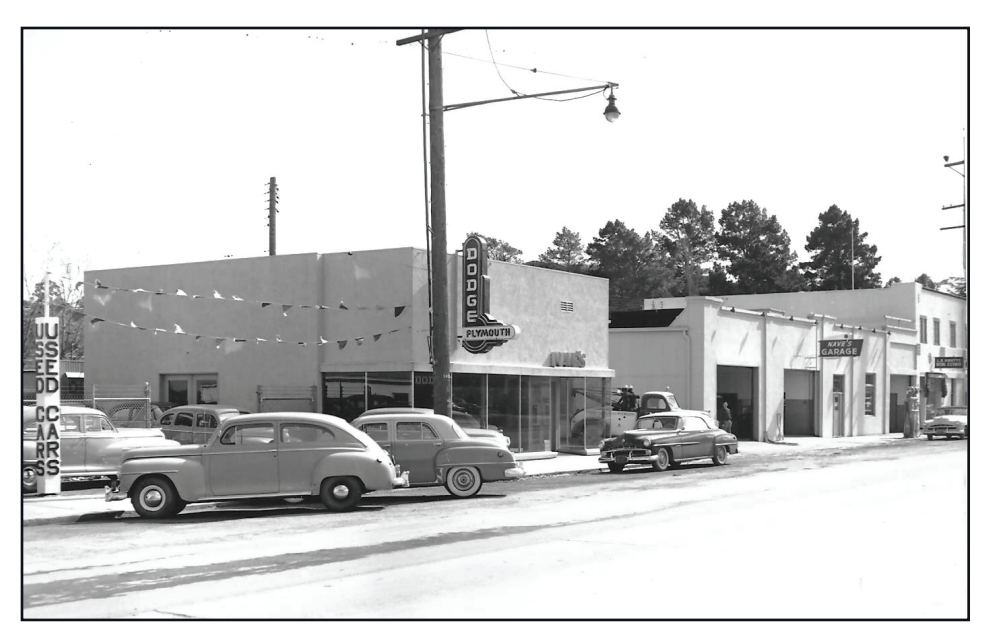
Nave's Garage and Dodge Dealership in 1952

I'm glad that there are now more activities for youth available. It's especially nice that there are so many sport opportunities for girls. There were no organized sports open to girls while I was growing up.