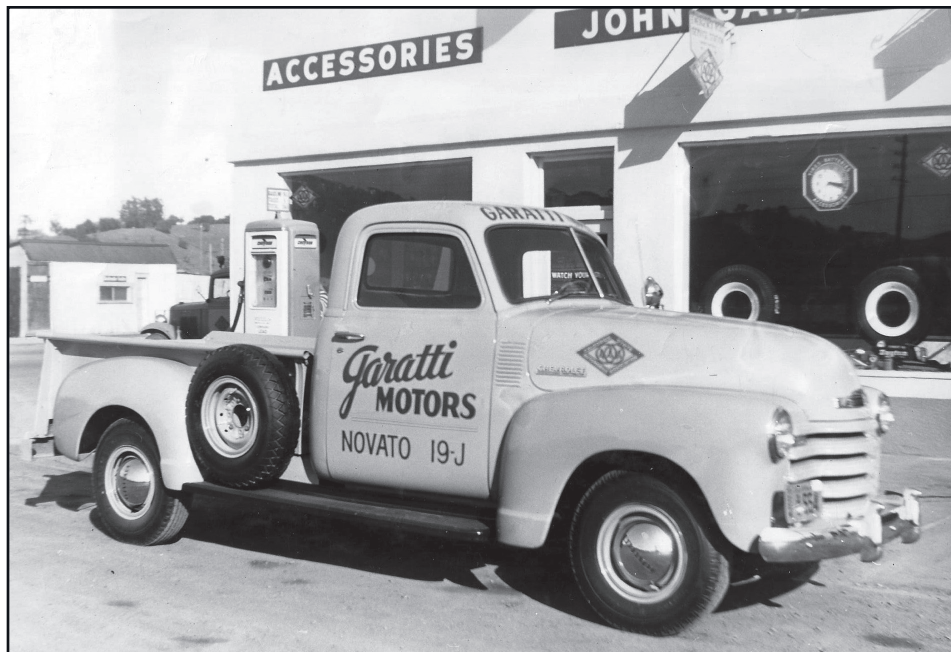
Garatti Motors, at the corner of Sweetser and Highway 101, circa 1949. Notice the gas pumps in front that had to be hand-pumped.