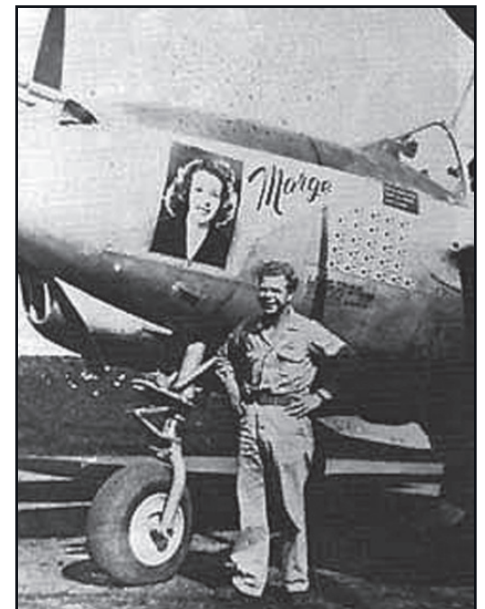
Dick Bong, America's "Ace of Aces," with his future bride painted on the nose of his P-38 fighter plane.