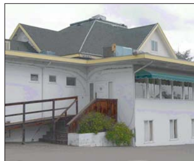
March 2008. Now the Hilltop Restaurant. Additions completely surround the original building.

The original building. The front of the building is now the side—the best view.