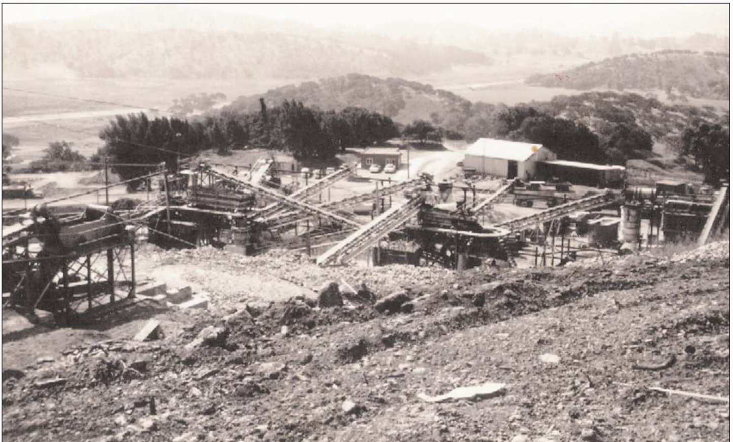
Another view of the Burdell Quarry in the 1950's