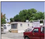
Bobo's Trailer Park ca. 2008

Seventh Street, petitioned the County to change the zoning to permit a 66 unit adult mobile home park to be built on 12 acres of the north end of their property. The park was proposed for the valley accessed from the south side of San Marin Drive about 700 feet east of Simmons Lane, an area not yet within Novato's city limits. This is currently known as Somerset Drive. This area was zoned for residential use in the County master plan. After being referred to the City for a courtesy review, the proposal received a negative recommendation from both City planning staff and the City Planning Commission. The County Planning Staff concurred in recommending denial. The Sandbach location required fairly substantial grading which Thomas Cordill, County Zoning Administrator, opined would