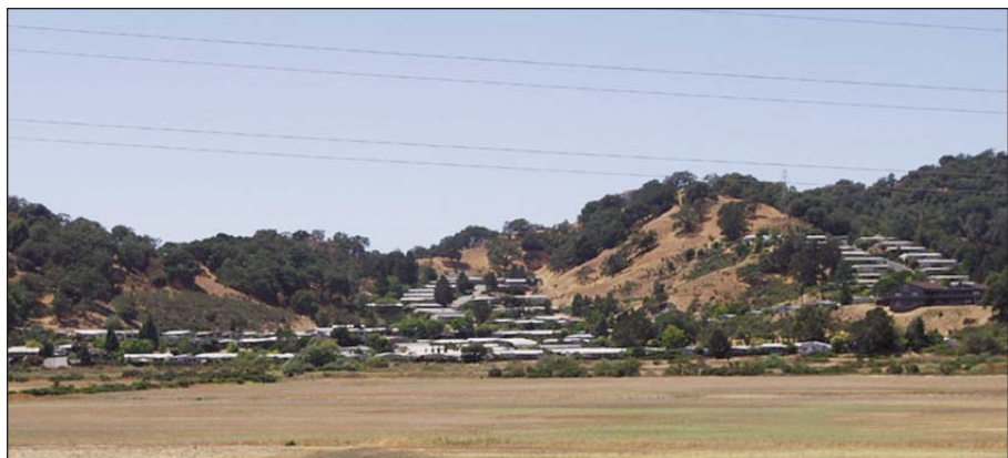
Marin Valley Mobile Home Country Club