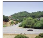
Location of the Sandbach property just off San Marin Drive, ca. 2008.

Prior to 1968 two mobile home park proposals had recently received approval by the County. One was a 440 unit proposed development along San Antonio Creek near the Sonoma County line north of Novato. This park would never come to