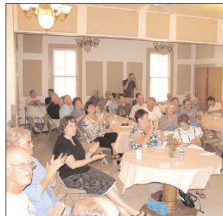
The September 2008 NHG meeting was held at Druids Hall. As usual everyone had a good time.