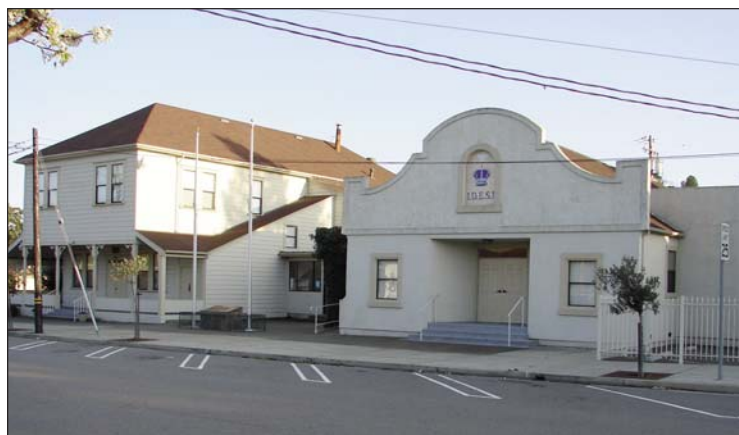
Located at 901 Sweetser Avenue, the building on the left was built in 1908 for Portuguese dancing and banquets. The building on the right was built in 1937 for American dancing. Both halls are still used often.