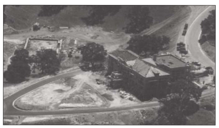
Hospital completed November 16, 1934 at a cost of $108,87. Swimming pool completed September 17, 1934 at a cost of $9,108.