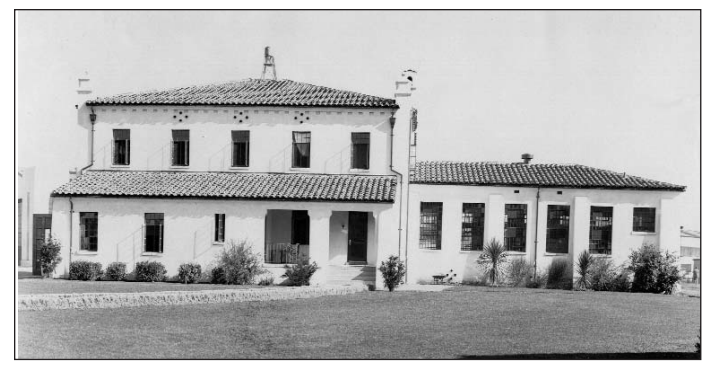
Picture of Fire and Guard house on Nov. 2, 1937. The Fire house was completed August 18, 1934 at a cost of $37,799. The fire house is now without the 3-cell brig.

Once again Marin developed a spurt of civic enthusiasm which produced a barrage of letters, telegrams, phone messages, and personal calls on Washington persuading the Administration to understand that Northern California would resent any delay in making the appropriation of the money already allotted for the project. These actions produced the desired result. On May 20,