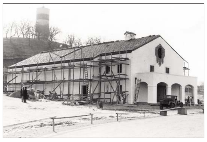
The War Department Theater completed April 7, 1938 at a cost of $54,387.

After 43 years of service, on January 11, 1976 an agreement was finally reached to close Hamilton as part of the post-Vietnam War drawdown of the military.