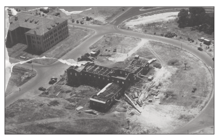
Headquarters building—left top Air Corps barracks #420 completed October 26, 1934 at a cost of $149,301.

Next, the matter of financing the purchase of the land for the base faced the Committee. The Government wanted 765 acres of the California Packing Co. land, which was offered to the County at $175.00 per acre. To raise these funds the Marin