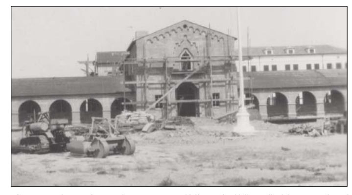
Construction of Headquarters Building, building #500, completed November 16, 1934 at a cost of $82,292.

A majority of the land on which the base is situated is reclaimed salt march. This land was diked and drained and presented a vast level surface making it an ideal landing field. The balance of the land is broken by low decomposed sandstone hills. These areas were used for quarters, hospitals, clubs etc.