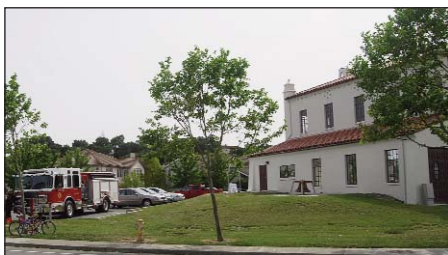
Dedication Day—Hamilton Museum

During open hours, please take some time and check out the new museum. You won't be disappointed.