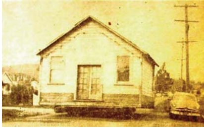
Moving day, 1953