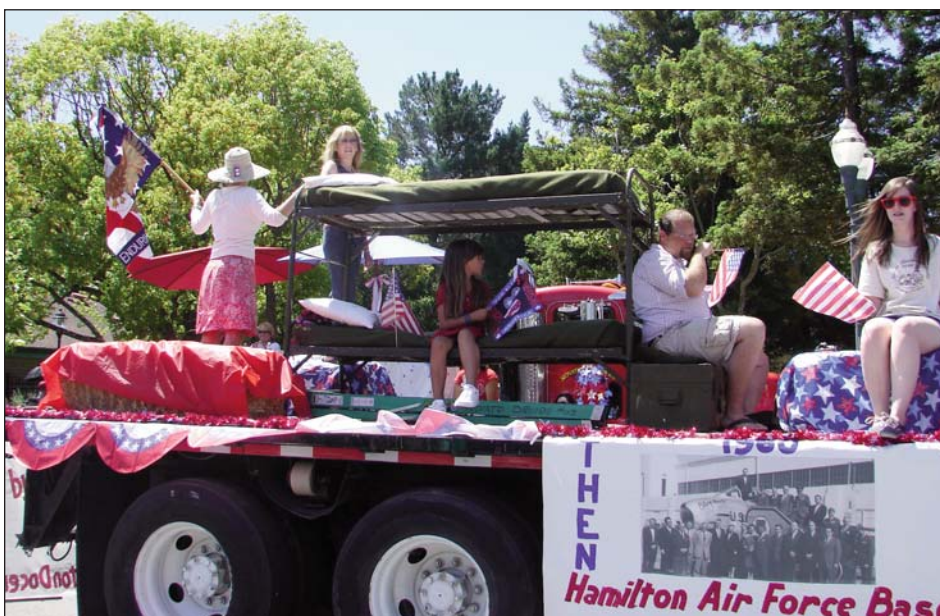
The Hamilton Air Force Base Museum had a nice float for Novato's 4th of July Parade.