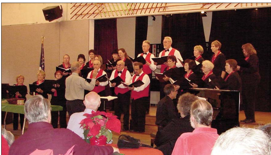
Wonderful Christmas and holiday music was part of one of the best Guild Christmas parties.