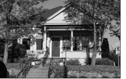
Hamilton House c.1908