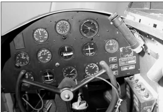
Instrument panel in cockpit of the Link trainer.