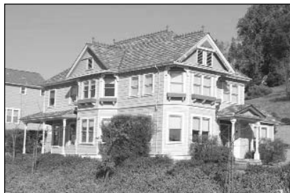
2012 Owner Centennial Homes