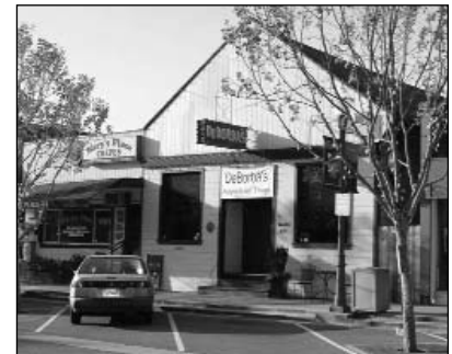
DeBorba's ca. 2012