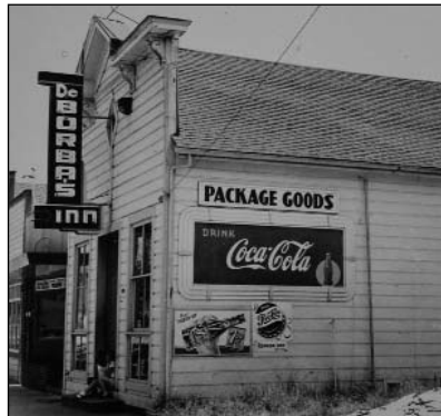
DeBorba's ca. 1910