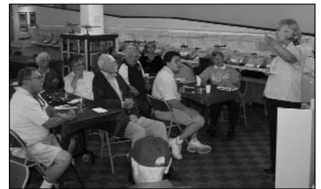
Members and guests listen to a guest speaker at the September 8 meeting at the Hamilton Field History Museum.