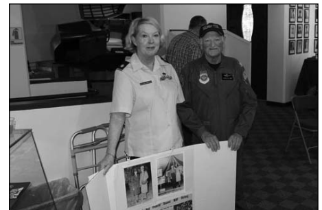
The Janovers husband and wife team were guest speakers at the September 8 General Meeting. Both serve as museum docents.