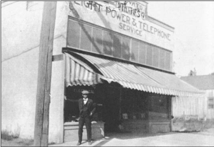
Novato Utility Company office at Grant and Machin.