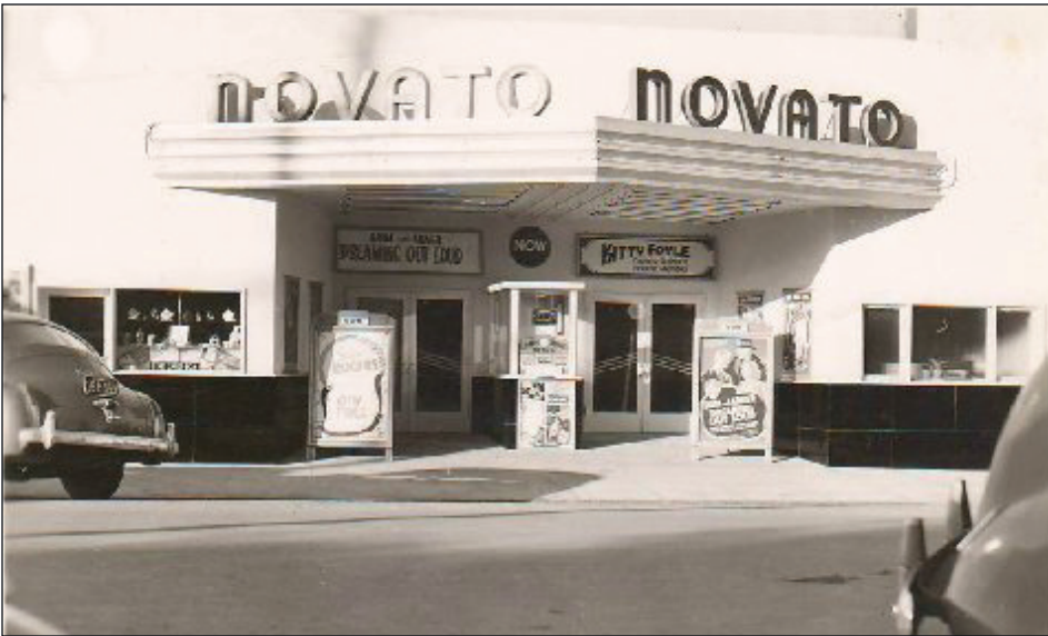
Earliest photograph of the Novato Theater c. 1946.