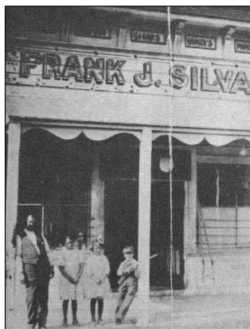
ca. 1906, 824 Grant Avenue