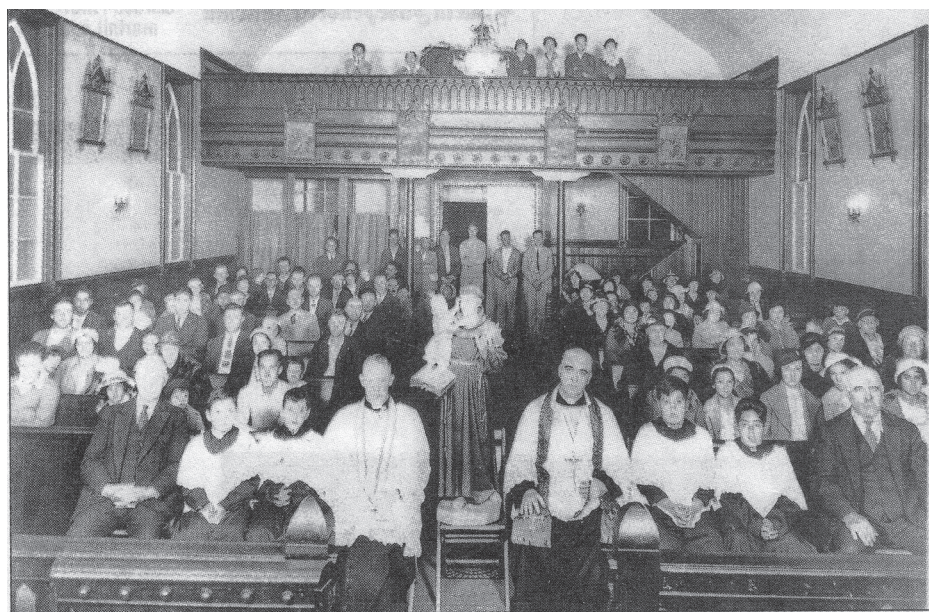
Taken at the St. Anthony celebration on Sept. 8, 1935