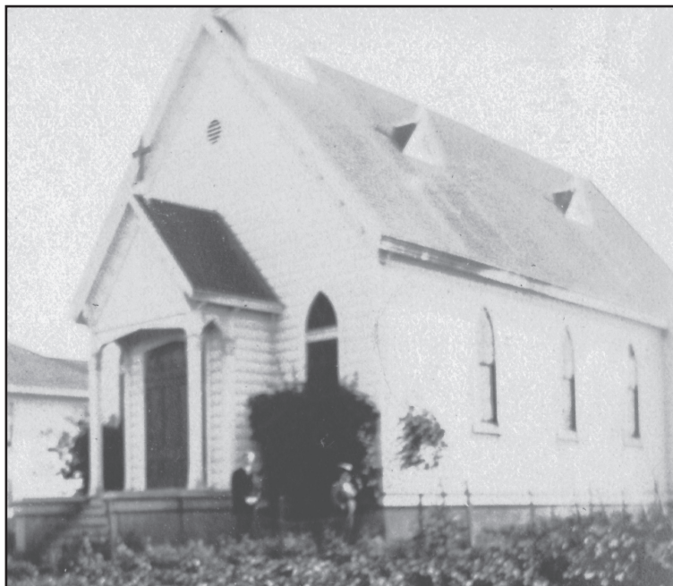
Our Lady of Loretto Church on South Novato Boulevard. Photo taken by Hellen Hatch around 1903.

It was the next month (April of 1891), that the newspapers would call the new church “the Church of Loretto. In May it was the “Loretto Chapel.” Mrs. Velasco would die on December 26, 1891. The parish of Novato was