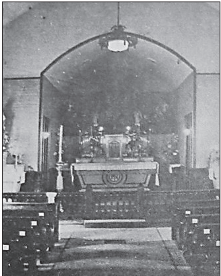
This photograph , taken sometime in the early 1930’s shows the altar of the church

The land and buildings offered for sale consist of a lot, the site of the old church, the eight-room parochial home, with a social hall included in the building, large garages, private water pressure system, orchard and every convenience. There are four