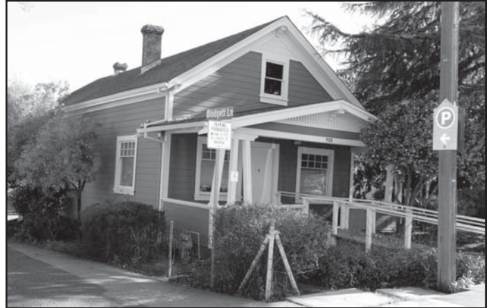
Hanen House - 2017