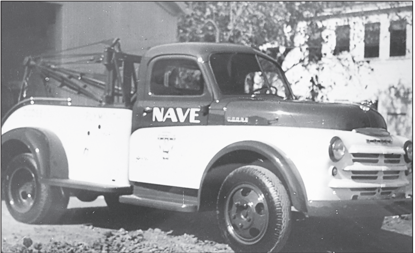
Nave's new tow truck in front of Nave's body shop on Machin Avenue next to the IDESA Hall.

a gallon of gas to a stalled car, haul a car out of the ditch, or meet the emergencies of the day and night with the best of them. In addition to running a day and night garage service, Louis ran the agency for the very smart Stars and Durants, now out of existence.