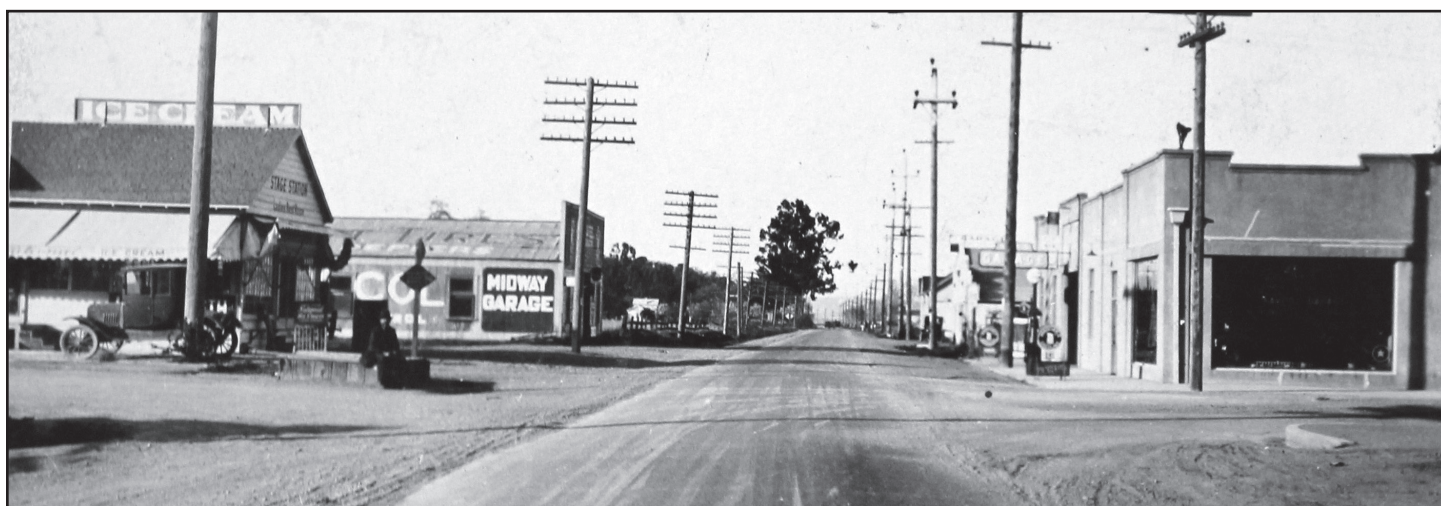
Looking north on Redwood Highway is the DeBorba Ice Cream parlor on the left, the old Midway Garage (next) and the new Nave Garage on the right.