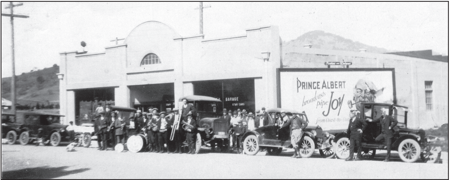
(Above) Nave Garage opening day with the band getting ready. (Below) Nave Garage building during the 1925 flood.